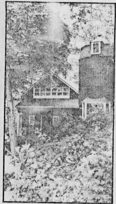
On opposite page, the home as seen from across road, and, counterclockwise, glasses and pitcher on stand in living room; Robert Saums in garden; another view of house; wheel and copper bells that served to announce tinker's arrival, and portrait of Saums' grandmother.